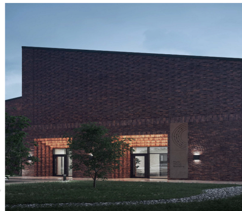
Architects' image of the future RND

This new radiopharmacy facility will primarily produce ^{99\text{m}}\text{Tc} -based radiopharmaceuticals, with a plan to provide a ^{68}\text{Ga} -radiopharmaceutical service in the future.