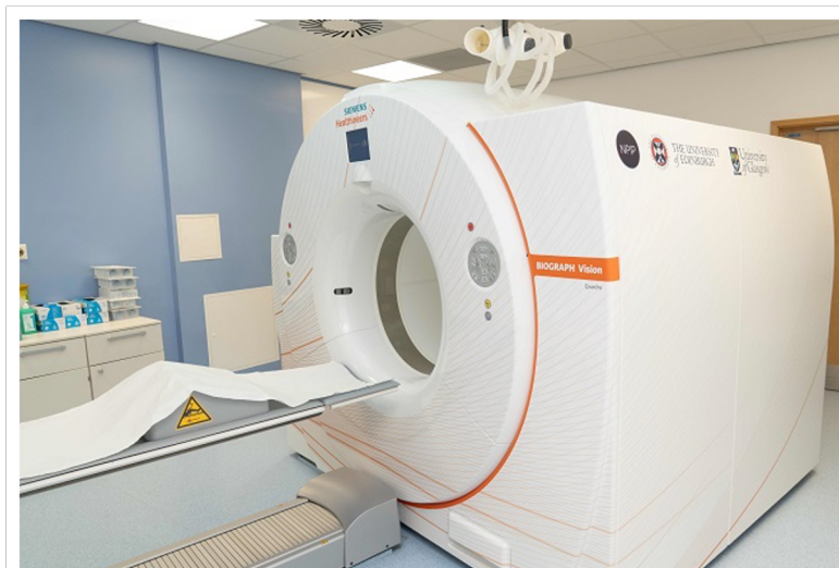
Scotland's 1 st total body PET

Collaboration between the radiochemistry teams in Glasgow and Edinburgh is growing stronger, with the goal of providing state-of-the-art radiopharmaceuticals for the new facility. As key part of this effort, the pre-clinical team in Glasgow plans to help the Edinburgh Imaging Radiochemistry facility translate the production of carbon-11 radiopharmaceuticals into GMP production. As