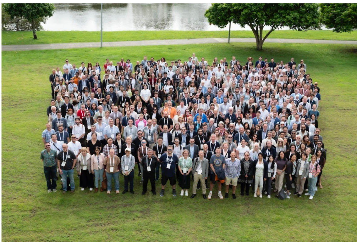
iSRS 2025 participants

Beyond the scientific programme, there was a full social programme that allowed new and old friends to connect both poster and beachside (where conference goers made use of their custom-made iSRS 2025 beach towels). Two