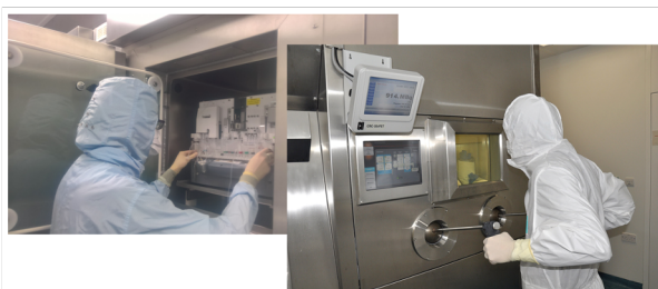
West of Scotland PET centres