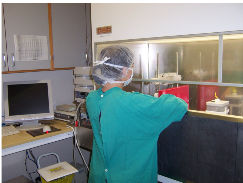
2007: Clinical production of [ ^{123}\text{I} ]5IA85380 in West of Scotland Radionuclide Dispensary, Western Infirmary