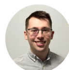
James PET Centres